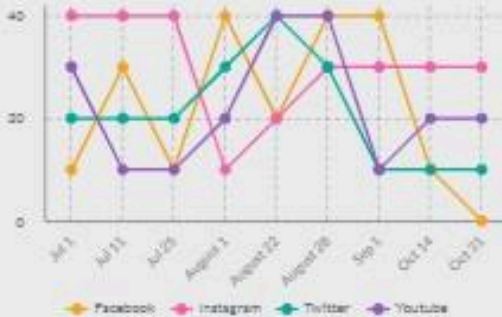
Social Media Sessions over the last quarter